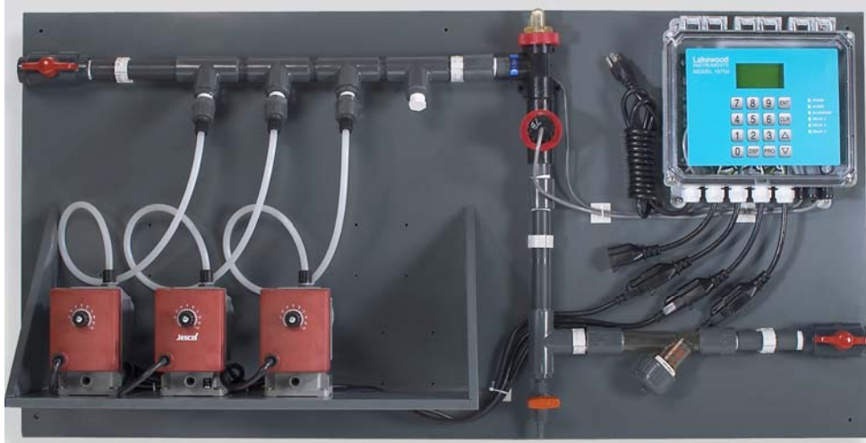
(Model 24-1575e shown with optional pump shelf and strainer)

The Model 22 is a wall-mounting, pre-fabricated rack system with cooling tower controller, up to 2 chemical metering pumps, a chemical injection manifold, inlet and outlet isolation ball valves, a sample valve, and a flow switch plumbing assembly on a 36 x 24 x 1/2 inch PVC plate.